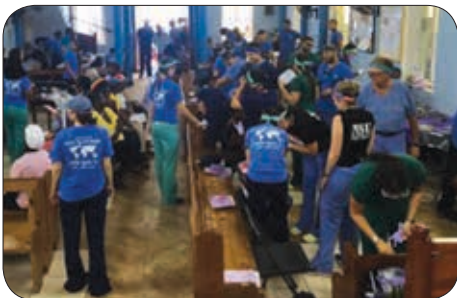
One of the many makeshift clinics at one of the churches in Saint Mary.

More than 140 individuals from various health disciplines including osteopathic medicine, dentistry, optometry, physical/occupational therapy, and pharmacy volunteered their time to provide care to the underserved communities of Jamaica. Volunteers included alumni, health professionals, and students from NSU's Fort Lauderdale/Davie and Tampa campuses, the Philadelphia College of Pharmacy,