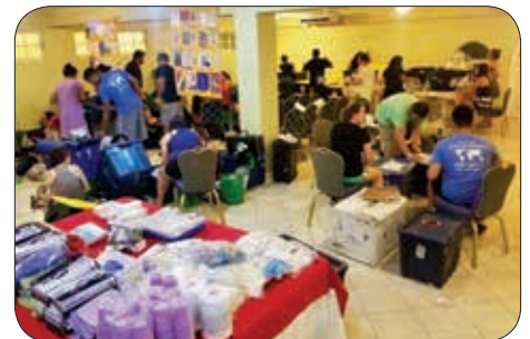
Restocking supplies at the hotel in preparation for the next day of clinic.